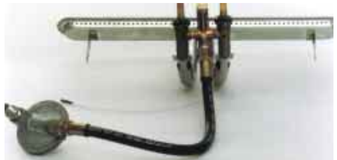
Above: The propane gas supply valves, burner, and pre-mix tubes, and pressure regulator.

The propane burner is ignited by turning on the gas and pressing the piezo-electric igniter button. A spark ignites the fuel-air mixture escaping from the burner. The flame heats lava rocks, distributing the heat to the grill. Liquids that drip onto the lava will vaporize and burn, shielding the burner from contamination. After cooking is finished, the gas is turned off and the heat stops. The lava cools quickly to ambient temperature.