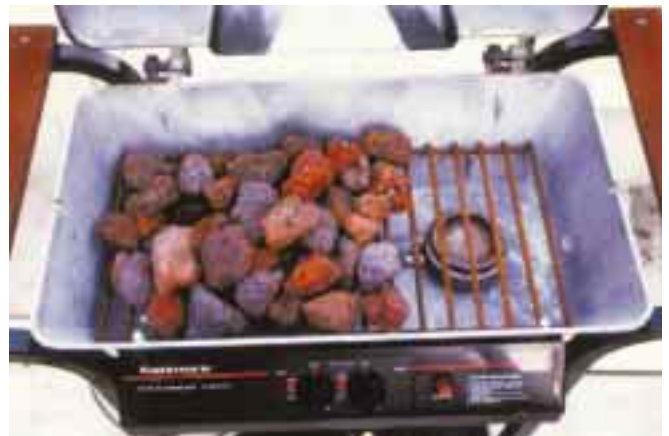
Above The burner installed in barbecue

Press the burner ring into the gas distribution base using a mechanical press. A completed burner is shown in the photo. The lava rocks have been removed from one side for clarity.