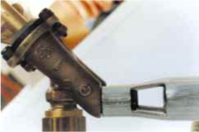
Above: The propane burners installed in our barbecue use fuel-air pre-mixers.