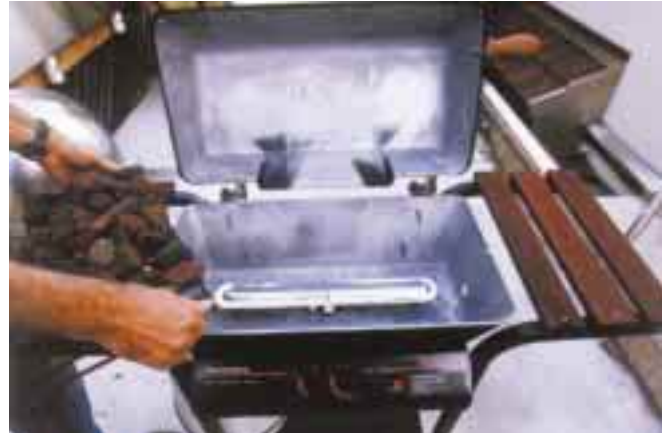
Above: By removing the cooking grill and lava rock support, you can see the stainless steel propane burner.

Propane barbecues are more convenient and produce less emissions than charcoal models. Propane also eliminates waiting while the coals get hot.