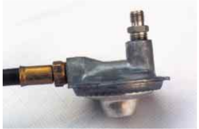
Above: The gas pressure regulator with Swage lock tubing INLET pipe fitting.