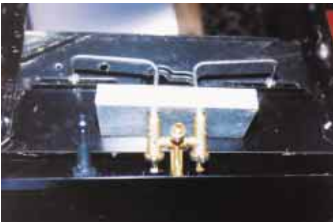
Above: Remove the jets and valve components, before silver-soldering stainless tubing.