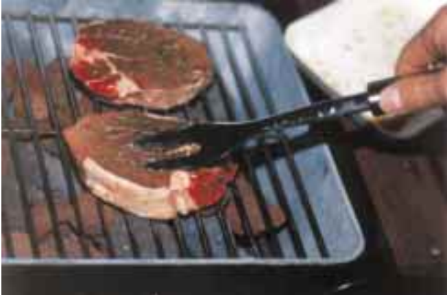
Above: Cooking Steaks on Hydrogen Gas Barbecue

We tried steaks for our first hydrogen barbecue as seen in this picture.