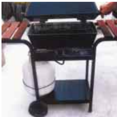
Above: The propane gas barbecue before modification

B arbecuing with hydrogen is cleaner than using charcoal or propane because there's no carbon in hydrogen. When hydrogen burns, it emits only water vapor and traces of nitrogen oxide. No toxic pollutants, smoke, or particulates are released by a hydrogen flame. When hydrogen is produced by renewable energy, the water-to-fuel-to-water cycle can be sustained virtually forever!