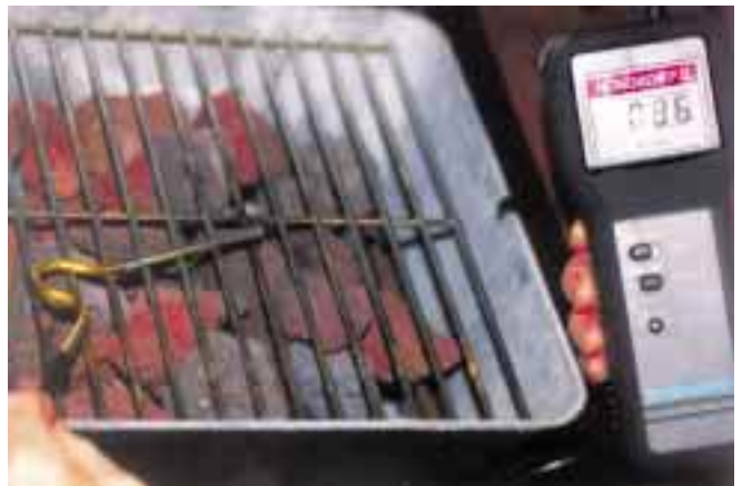
Above: Test setup showing barbecue, NOx meter at 50% hydrogen flow (86 ppm)

We also tested the completed burner for heat release and nitrogen oxide emissions. A NOx meter was used to sample the burner's hot exhaust gas plume at different positions. We used a Bacharach NONOXOR II with a range of 0-2000 parts per million (ppm) NOx. These meters are used for field testing engine exhaust for emission compliance.